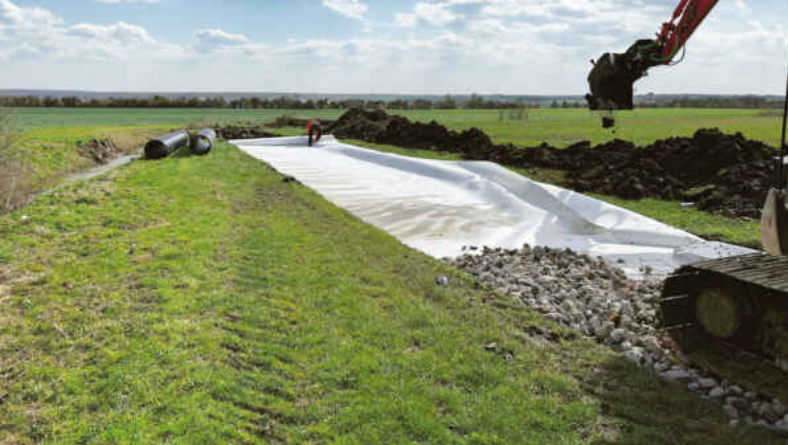
Pic. 1: Installation of base course on top of Combigrid®