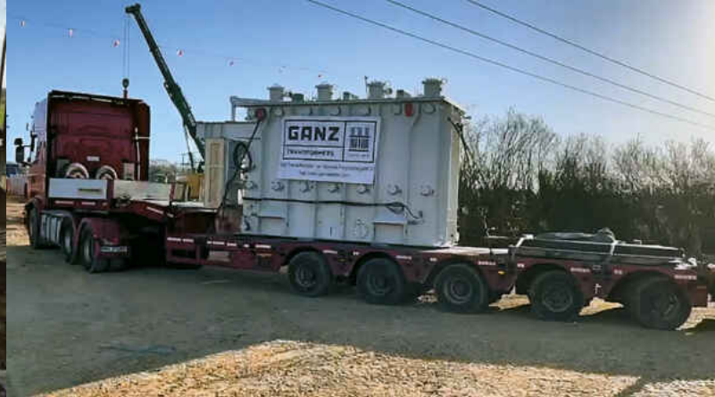
Pic. 2: Flat-bed trailer on access road

Situated around 10 miles north of the River Thames, between Tilbury and Brentwood, the Bulphan Fen Solar Farm and electricity storage facility is expected to generate sufficient green energy to power over 23,000 homes for the next 35 to 40 years, displacing around 16,000 tonnes of carbon dioxide per year when compared to electricity generation from non-renewables.