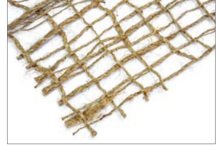
Figure 6: Baled jute nets