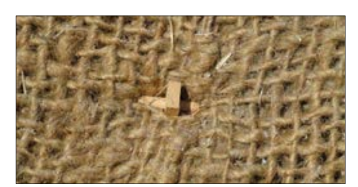
Figure 5: Jute net with wooden pin