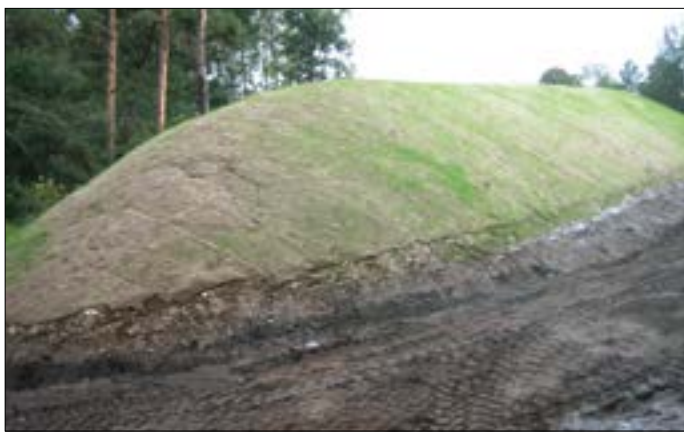
Figure 8: Jute nets on a slope

We recommend fixing Secumat® Green Jute N 500 20x30 with Secumat® Green PinW 30 wooden pins. (Fig. 4)