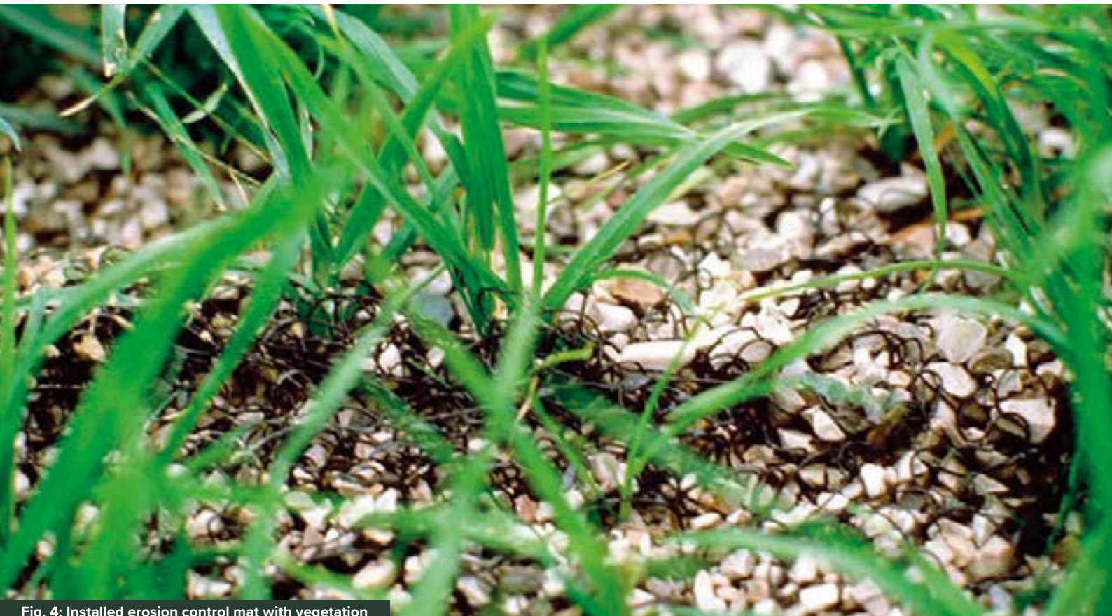
Fig. 4: Installed erosion control mat with vegetation

The open extruded monofilament structure favoured rapid and long-term vegetation. The Secumat® erosion control system has been in use since 2006 and protects the car park perimeter against surface-parallel erosion.