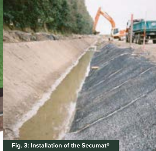
Fig. 3: Installation of the Secumat® erosion control system