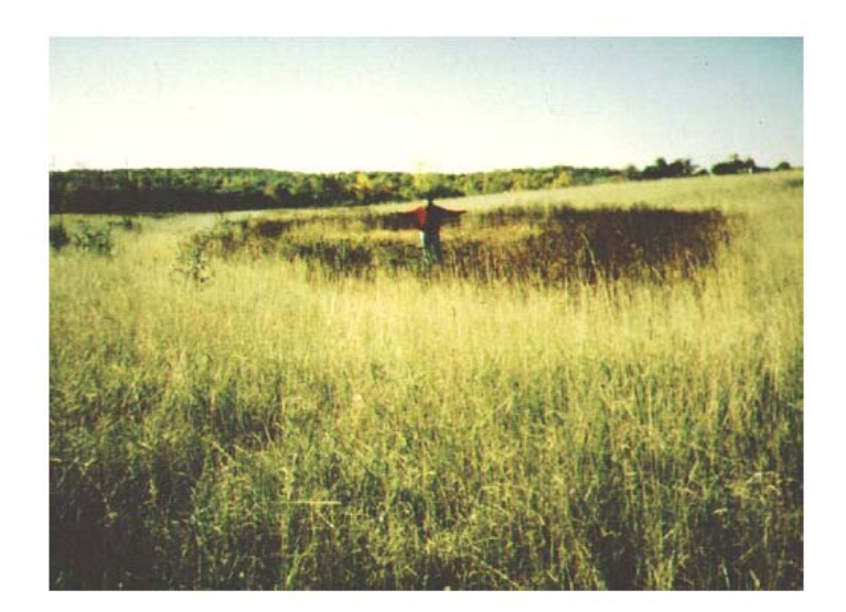
Figure 3. Visible disturbances in plant growth indicate a seal failure

At the Damsdorf landfill in northern Germany, it was possible to wait for landfill body deformation and settlement to take place or to control it in such a manner that the permissible elongation of the stiff boulder clay ( \varepsilon = 2.5\% (0.25%)) employed there would not be exceeded, and furthermore that anticipated vertical deformations, of the order of 3 to 5% of waste depth, would not lead to deformation-related damage to the sealing.