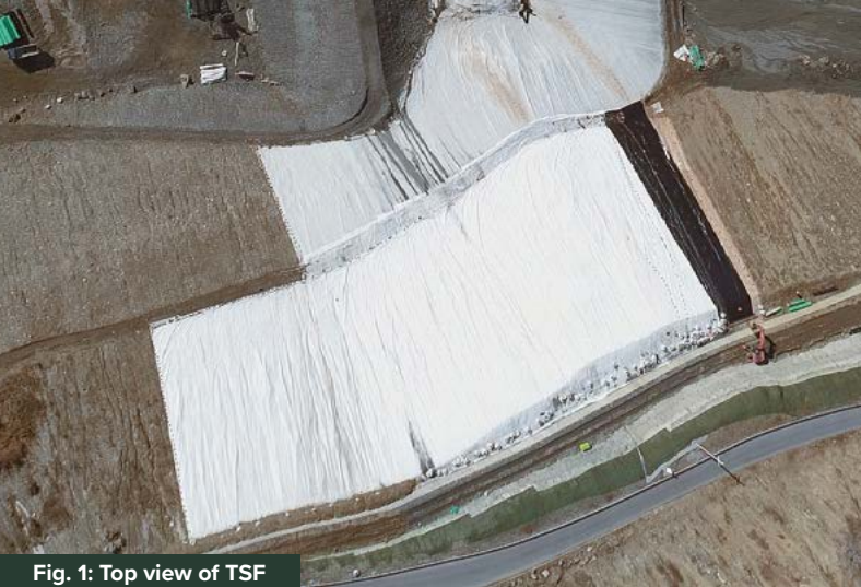
Fig. 1: Top view of TSF