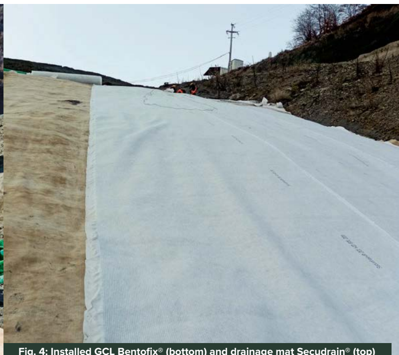
Fig. 4: Installed GCL Bentofix® (bottom) and drainage mat Secudrain® (top)