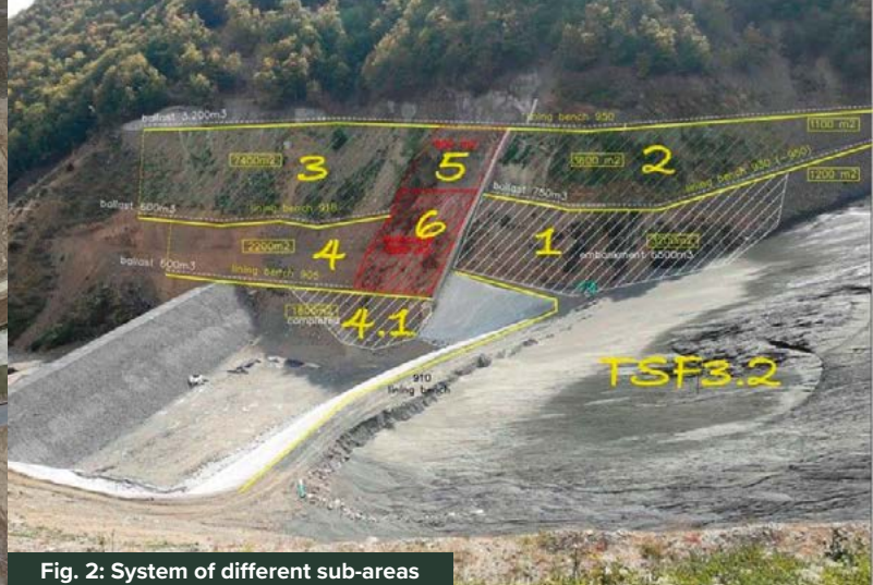
Fig. 2: System of different sub-areas