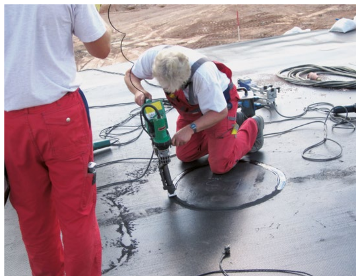
Figure 1: Welding on-site is improved by the high melt flow rate

Decades of installation experience have also influenced product characteristics, which ensure efficient and precise installation: protection strips on the welding areas, lateral marking, meter scaling, and a high melt flow rate (MFR: 1-3g/10 minutes tested at 190°C/5kg).